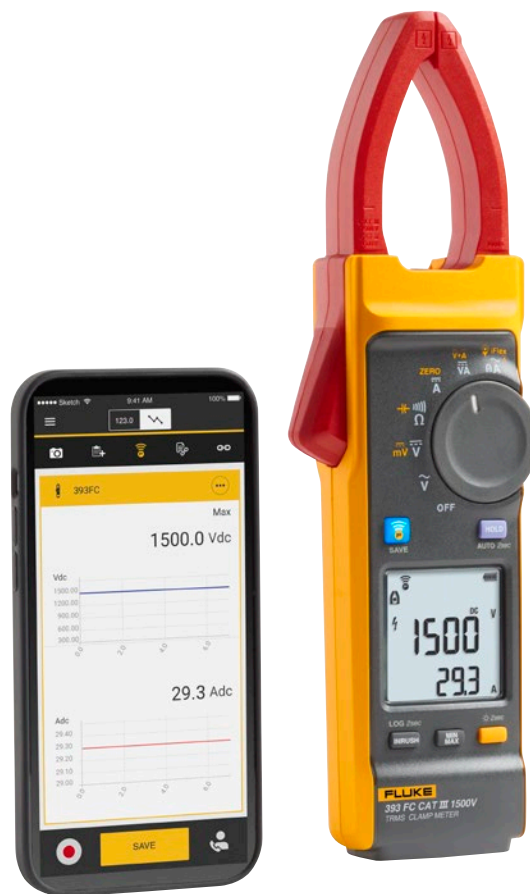
The Fluke 393 FC is the world's only CAT III 1500 V rated clamp meter, making it safe and reliable to use on solar installations.

Check the insulation resistance of your conductors, the connections between modules and between modules and racking, and your resistance to ground. Use the Fluke 1630-2 FC Earth Ground Clamp to measure earth ground resistance to ensure a resistance of less than 25 ohms.