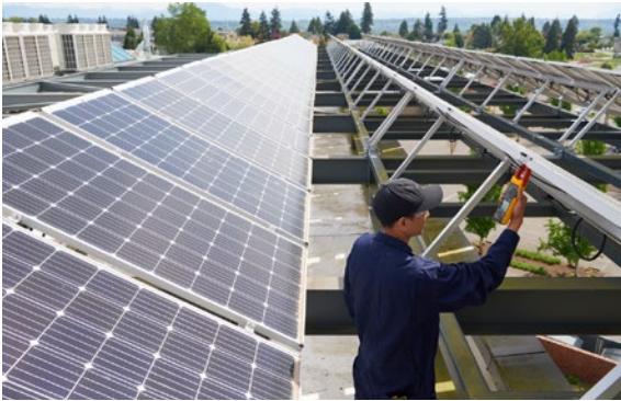
The Fluke 393 FC can measure voltage, current, dc power and provide audio indicator for incorrect polarity on PV panels.